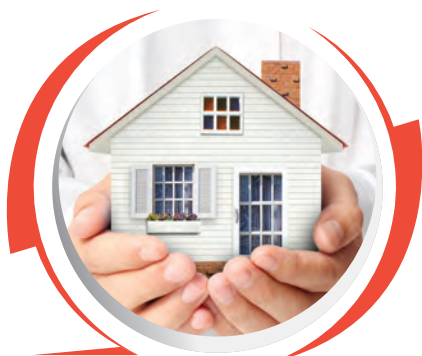
Housing & Shelter

Expected End Ministries requires monetary and material contributions and donations for the following 9 areas of immediate need.