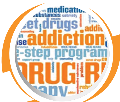
Substance Abuse Programs